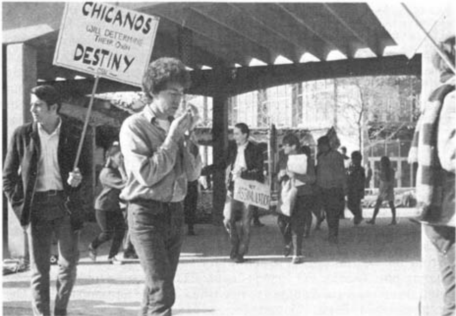
CSU. During the 1969 Winter Quarter, the Chicano Student Union became extremely active and staged marches in front of the Administration Building.