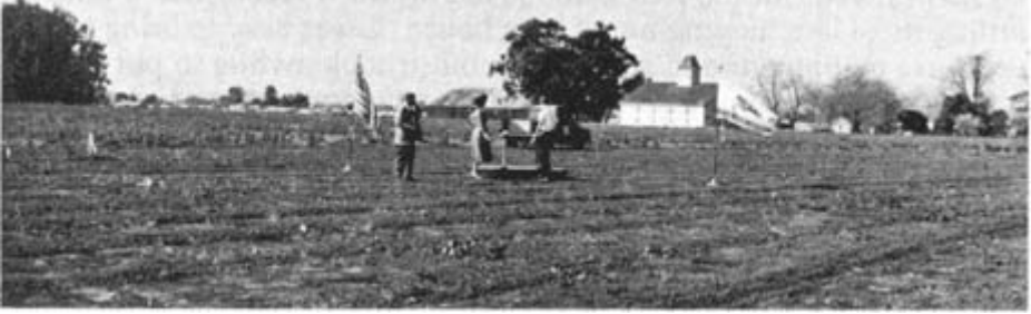
FRY SITE. One of the most important events in Chabot's history occurred February 23, 1964, when ground-breaking ceremonies were held for the new campus in Hayward. The above photo was taken early in the afternoon of this day, prior to the start of the ceremonies. In the background may be seen the barn on the grounds of the historic Fry home. At extreme left is the grove of eucalyptus trees which are now a part of the college campus.