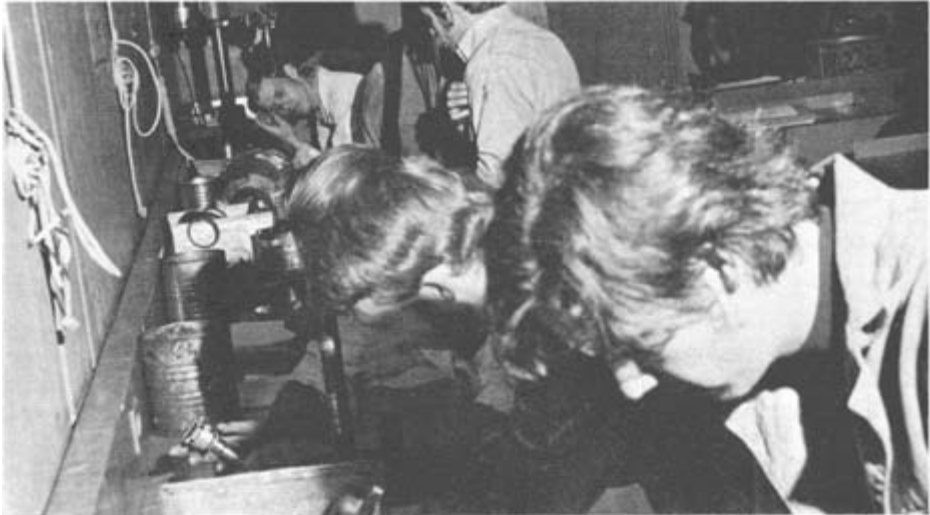
CROWDING. Typical of the crowded conditions on the campus were those prevailing in the Automotive Technology laboratory. The above picture shows students crowded together at the work benches.