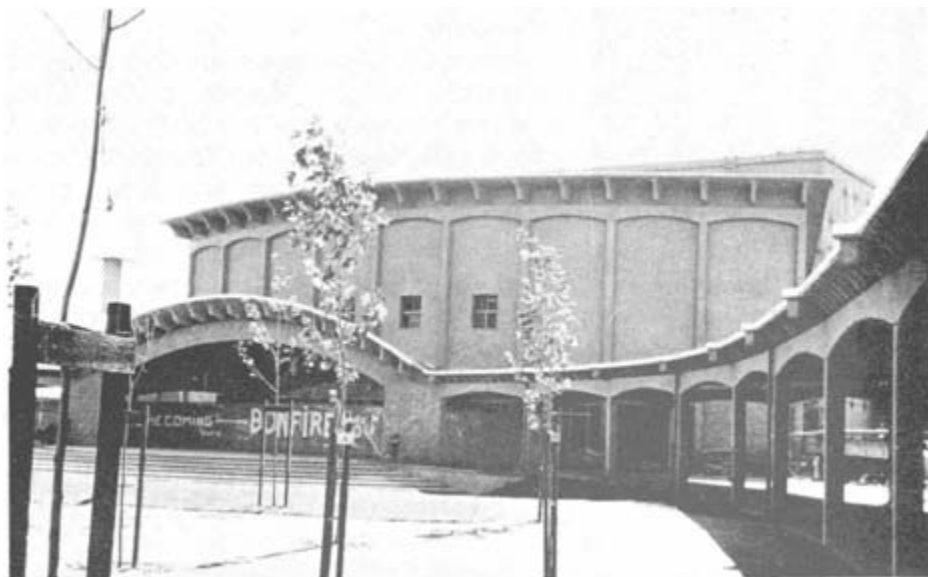
AUDITORIUM. The College-Community Auditorium makes an imposing building in this photograph, which shows part of the campus amphitheatre in the left foreground. The auditorium completed the design of the campus inner court, complementing the Library at the court's north end. Note the homecoming poster on the grand stage entrance outside the theatre, announcing a bonfire to highlight the event.