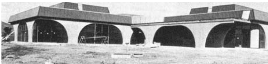
NEARING COMPLETION. Valley Campus was the scene of many visits by college, community, and neighboring friends of the district. In this photo the first cluster of buildings nears completion.