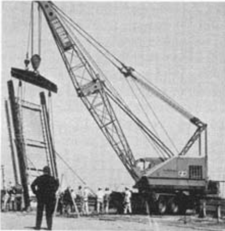
FIRST WALL. A heavy duty crane was employed to erect the first wall section as construction got underway on Building 300 at the new campus, providing a new aspect for viewers from Depot Road, seen in background.