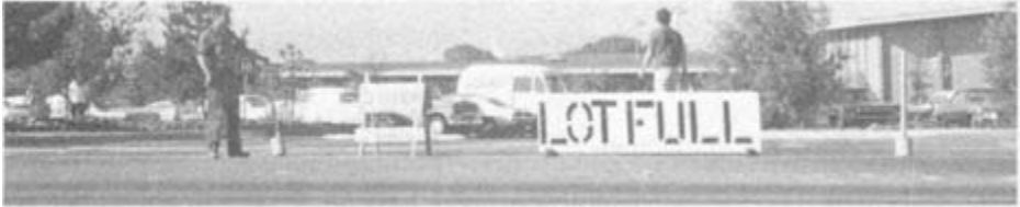
LOT FULL. The sign, "Lot Full," appeared every morning at the entrance to student parking lot "B" around 8:30. The numbers of students placed a severe strain on campus parking facilities.