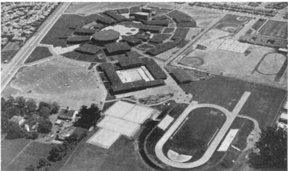
AERIAL VIEW. By the time Autumn Quarter started, Chabot College's new campus was a thing of beauty. This photograph was taken August .18, 1966, which accounts for the absence of automobiles in the parking lots. Work was well underway on the last building to be constructed-the 1,500 seat College-Community Auditorium shown at the upper end of the oval in this picture.