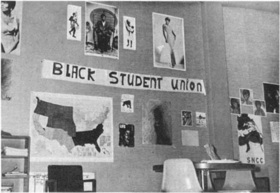
BSU. Pictured here is a view of the Black Student Lounge as set up by the Black Student Union on the second floor of the Student Union Building.