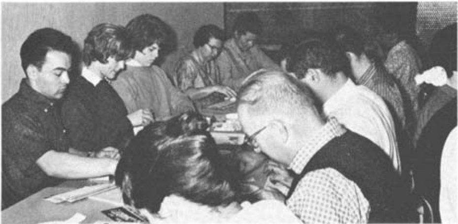
LAST MINUTE MAILING. Students, residents of the district, faculty and staff turned out on a Saturday morning in April, 1963, to get out a last minute mailing of materials on the bond issue. The college library was the scene as these volunteers addressed and tied brochures to be sent to all registered voters in the district.