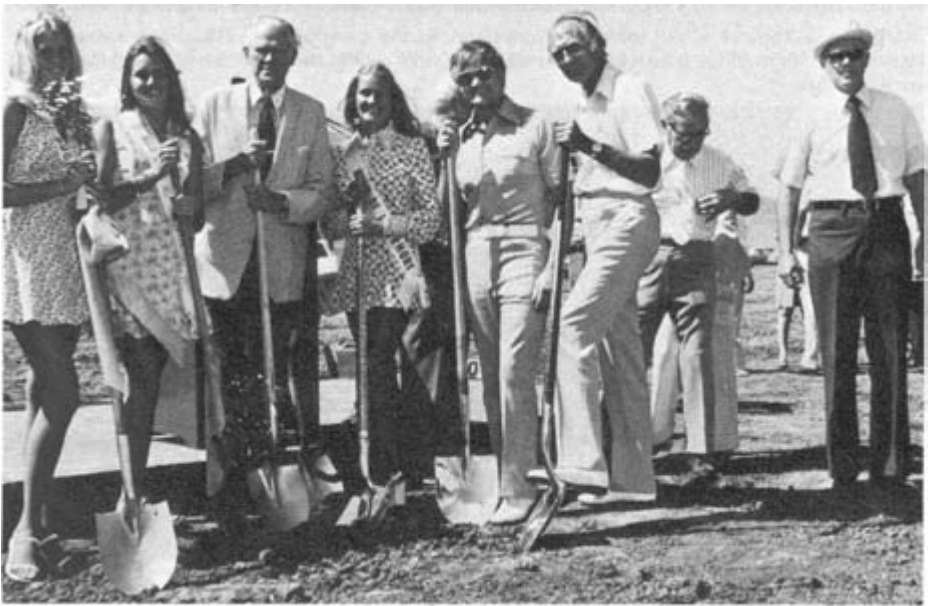
PRETTY MAIDS. Maids of Dublin, Pleasanton and Livermore joined with officials at the Valley campus ground-breaking ceremonies.