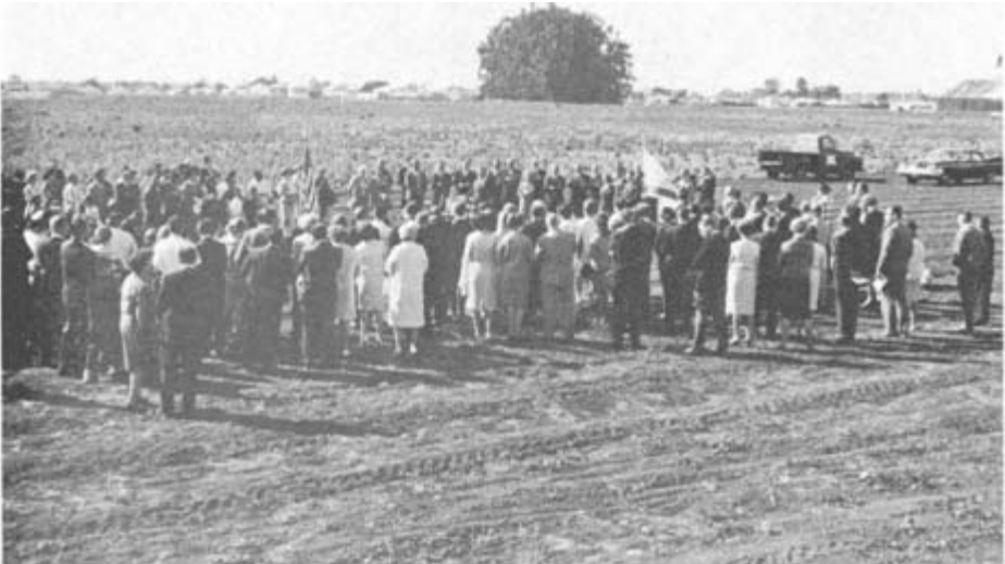
THE COMMUNITY. Part of the crowd which attended the ceremony is pictured above.