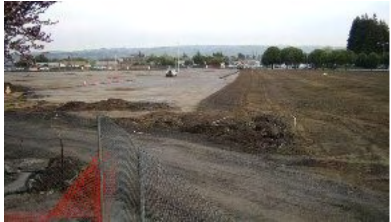
Above: Facing Bldg 1600. Right: Parking Lot G Below: Bldg 700