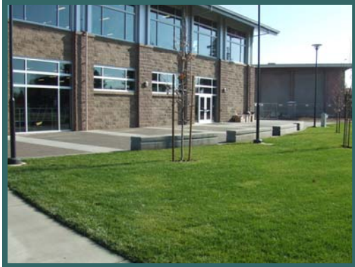
Exterior of Building 4000.