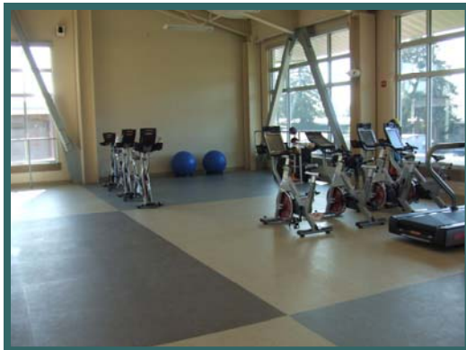
Both photos include the interior of our new Building 4000.

Building 4000, Strength & Fitness Center is Occupied — Building 4000 is complete and being used for Spring Semester 2012 classes. The building houses varsity sports weight lifting on the first floor, and a fitness center on the second floor. The Physical Education Department is looking forward to using this great new building.